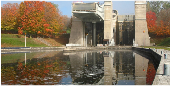
Peterborough Liftlock Sightseeing Cruise